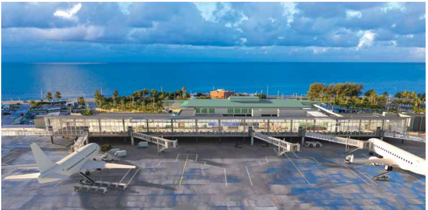
An artist's rendering shows the concept for a new $80 million expansion to be constructed at Key West International Airport.