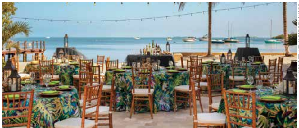
The Marriott Key West Beachside features waterfront and inside event venues.

Barbary Beach House Key West is rebranded as the 186-unit, three-story Margaritaville Beach House Key West. The pet- and family-friendly property, located across from Smathers Beach, includes the Tin Cup Chalice & Chill restaurant, new bar concepts and expanded retail space as Key West's only Margaritaville resort. MargaritavilleBeachHouseKeyWest.com