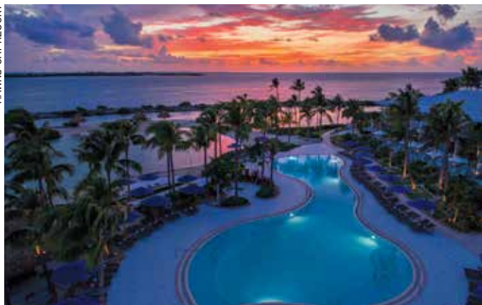
HAWKS CAY RESORT

Covering 60 acres on Duck Key, Hawks Cay Resort is marketed as the most expansive resort in the Keys.