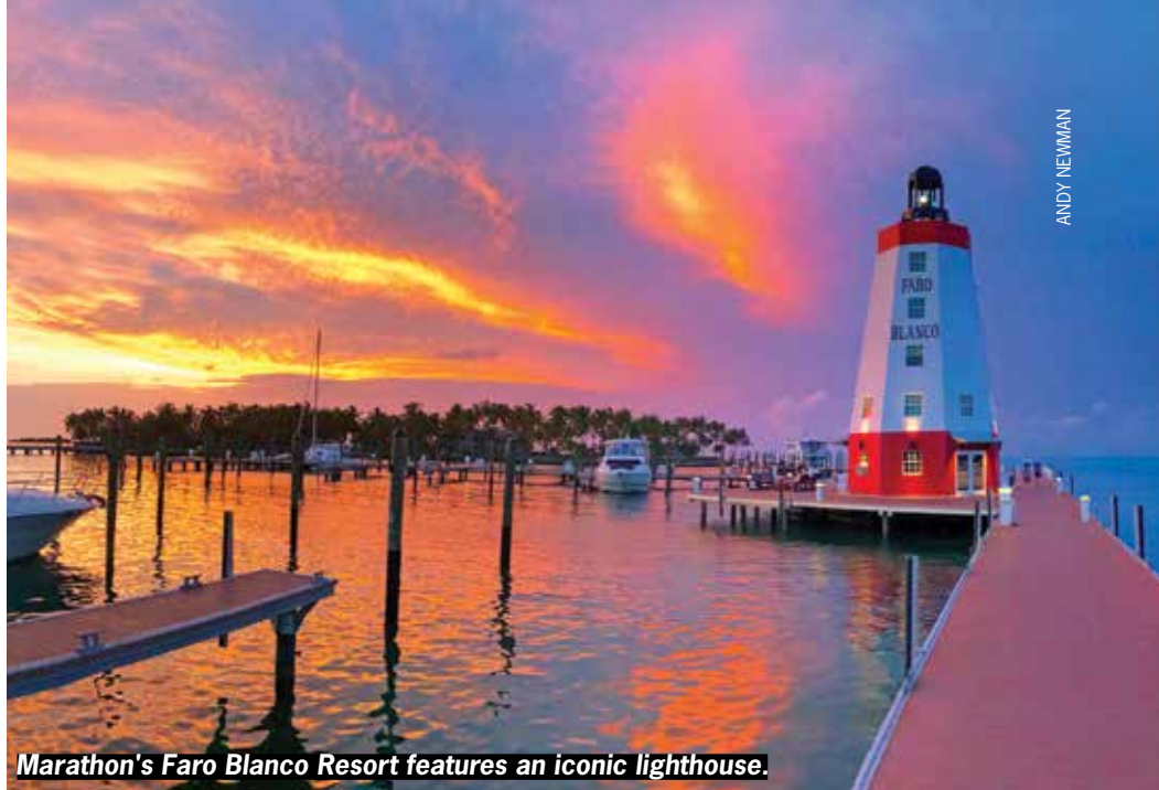
Marathon's Faro Blanco Resort features an iconic lighthouse.

The 222-room Marriott Key West Beachside, with 129 one-, two- and three-bedroom suites, offers Key West's largest ballroom at 5,673 square feet, in-house audiovisual