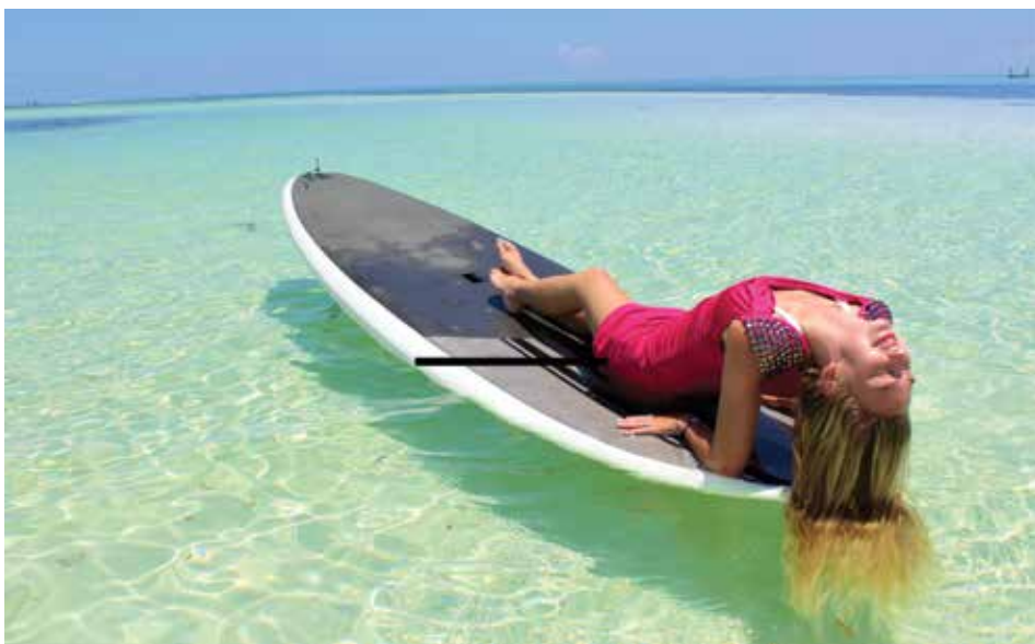
Serenity Eco Therapy offers meditation and yoga on a paddleboard.